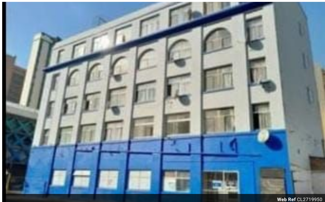
Web Ref CL2719950

279 Problem Mkhize Road, Essenwood, Durban, 4001