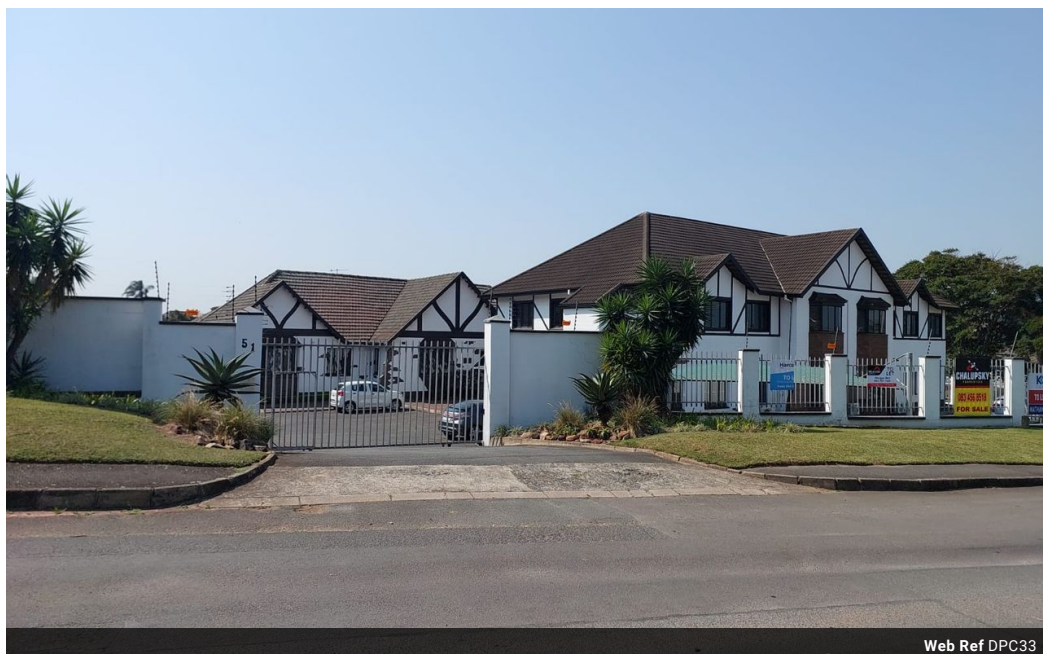
Web Ref DPC33

1 Knightbridge, 16 Westville Road, Westville