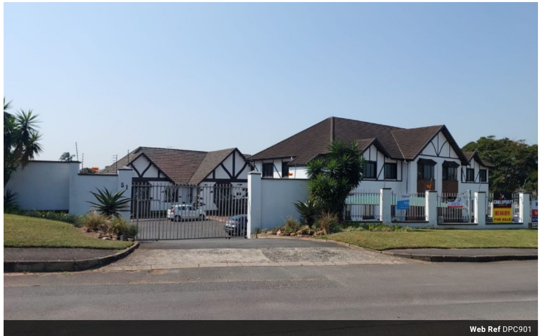
Web Ref DPC901

1 Knightbridge, 16 Westville Road, Westville