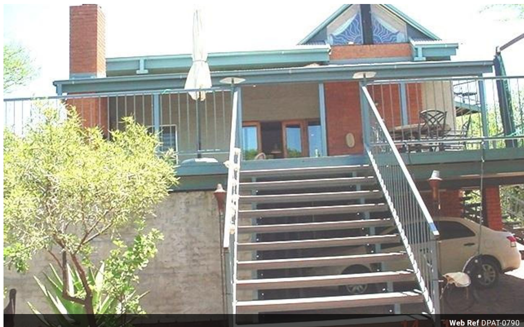
Web Ref DPAT-0790