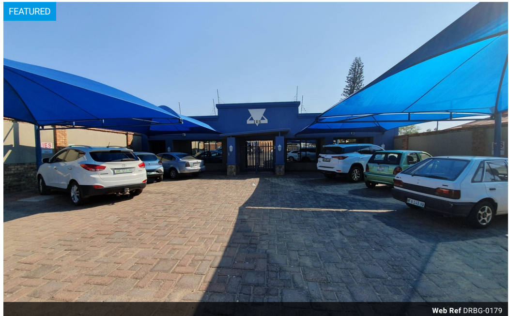
Web Ref DRBG-0179