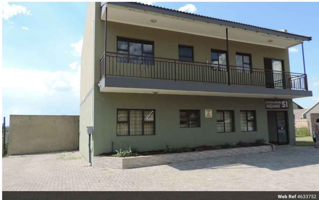
Web Ref 4633752

18 Klip River Drive, Three Rivers, Vereeniging