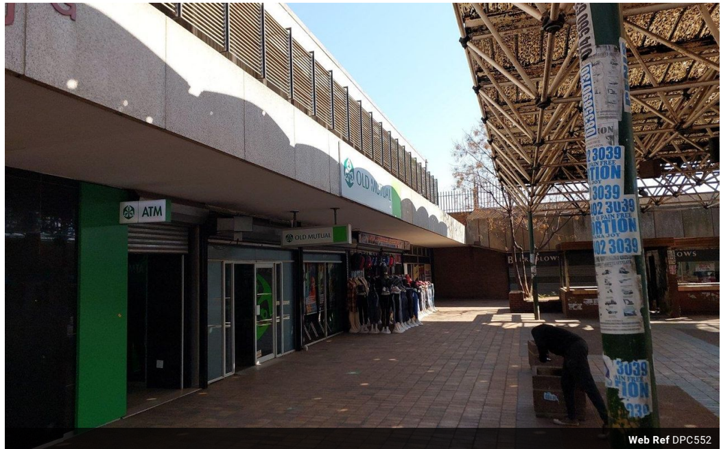
Web Ref DPC552

18 Klipriver Drive Three Rivers Vereeniging