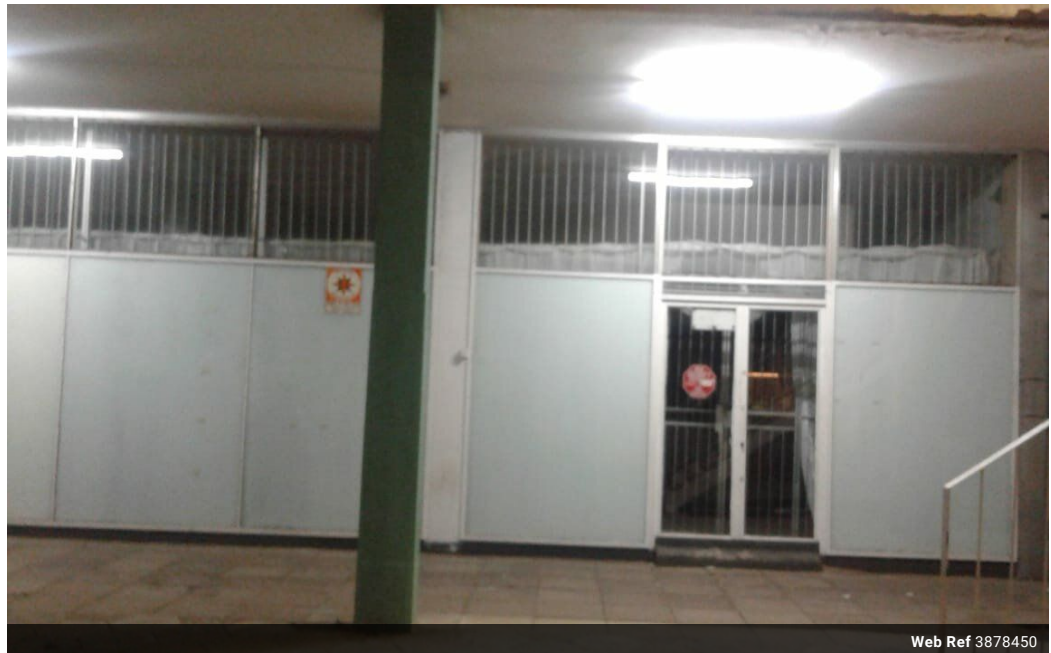
Web Ref 3878450

18 Klip River Drive, Three Rivers, Vereeniging