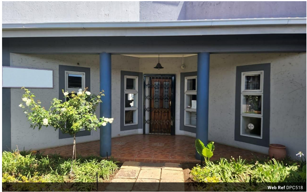
Web Ref DPC518

18 Klipriver Drive Three Rivers Vereeniging