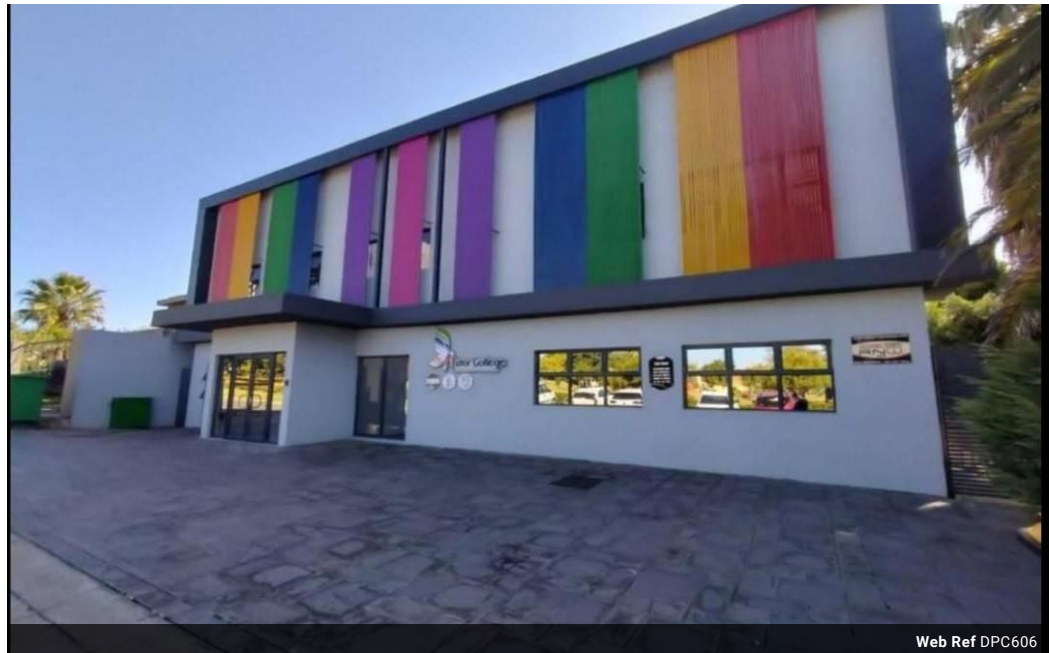
Web Ref DPC606

18 Klipriver Drive Three Rivers Vereeniging