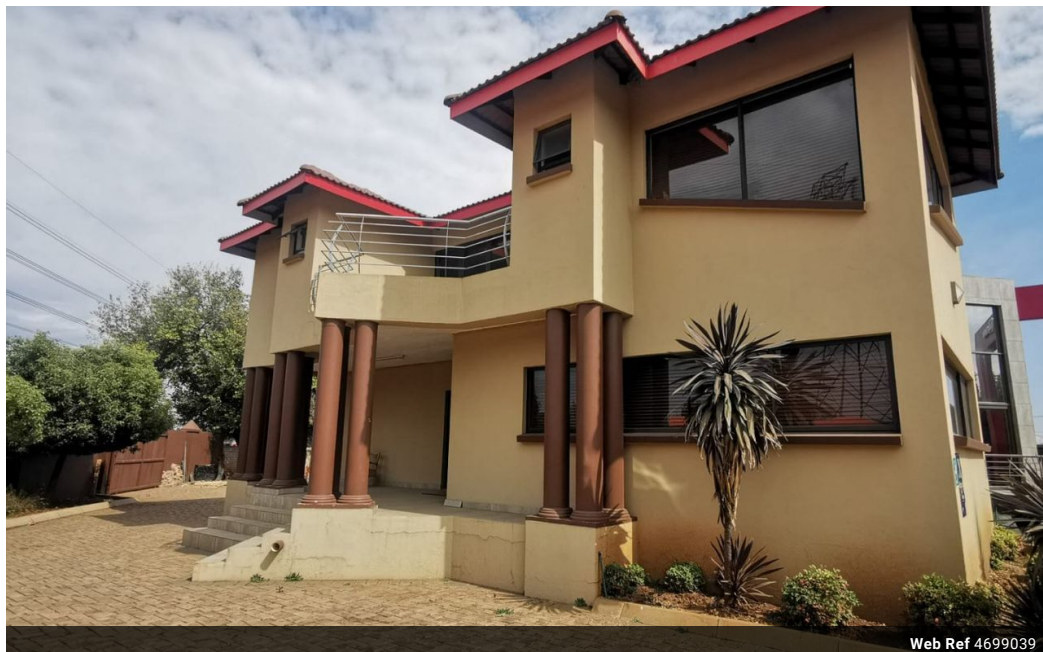
Web Ref 4699039

18 Klip River Drive, Three Rivers, Vereeniging