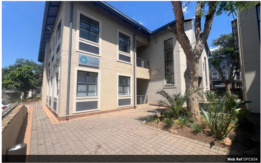
Web Ref DPC854

95 Victoria Street, Oakdene, Johannesburg, Gauteng, 2190