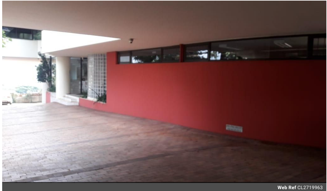
Web Ref CL2719963

279 Problem Mkhize Road, Essenwood, Durban, 4001