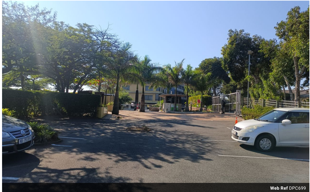
Web Ref DPC699