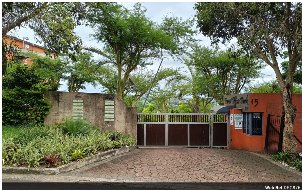
Web Ref DPC876