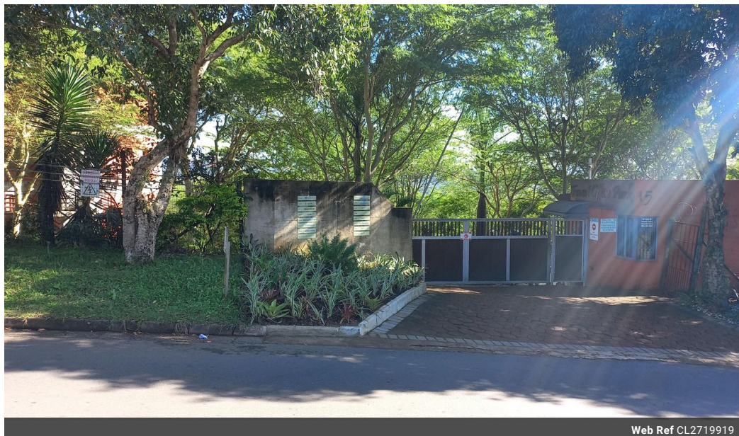
Web Ref CL2719919