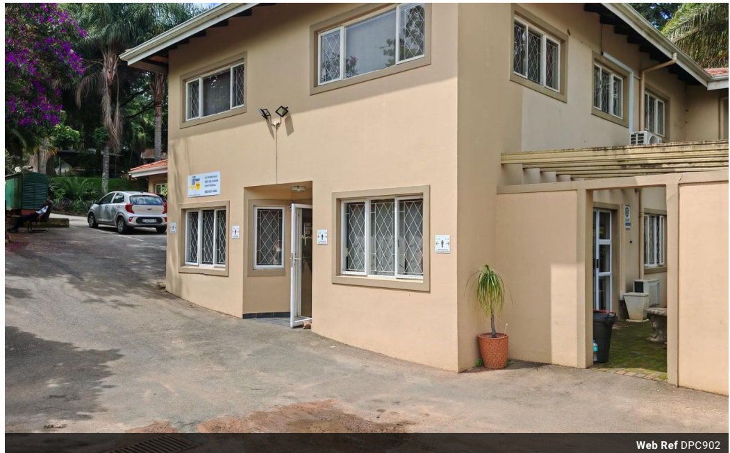
Web Ref DPC902

1 Knightbridge, 16 Westville Road, Westville