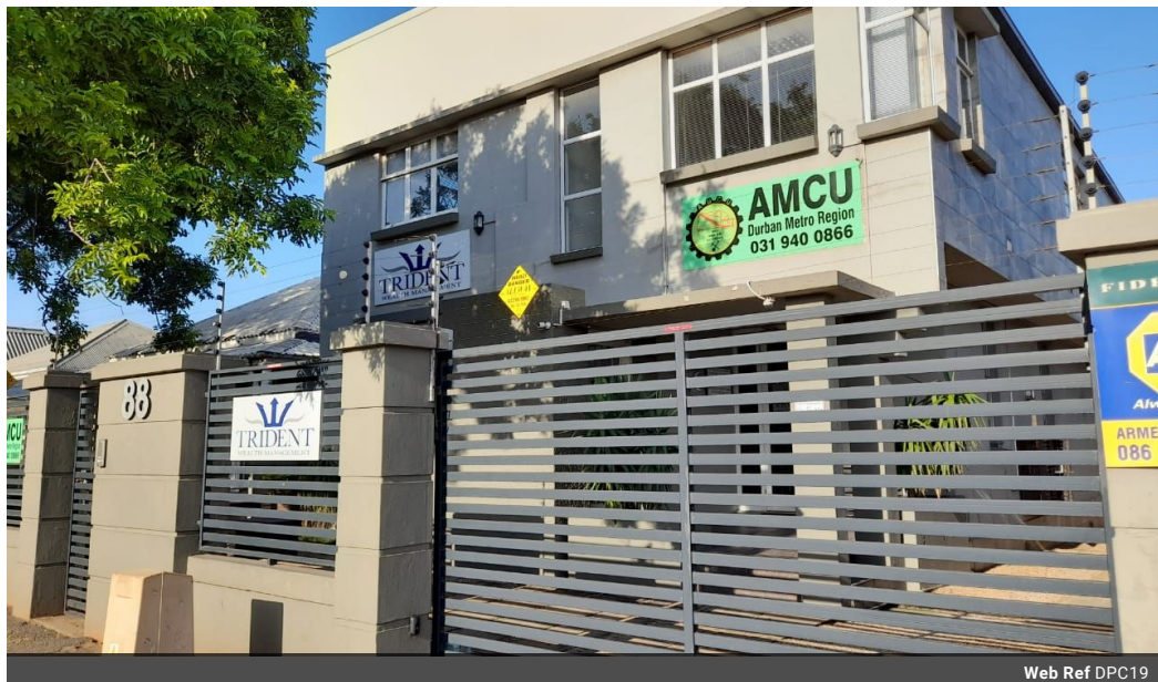
Web Ref DPC19