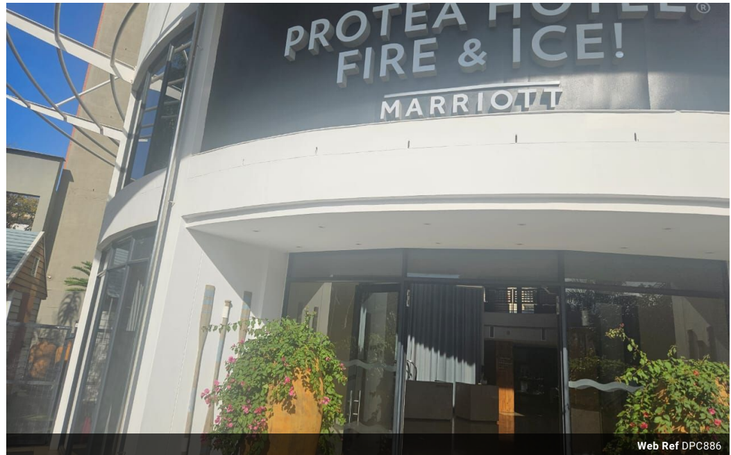
Web Ref DPC886

558 Mountbatten Drive Reservoir Hills Durban 4090