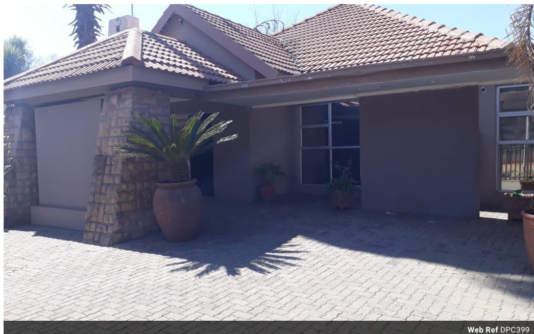
Web Ref DPC399

18 Klipriver Drive Three Rivers Vereeniging