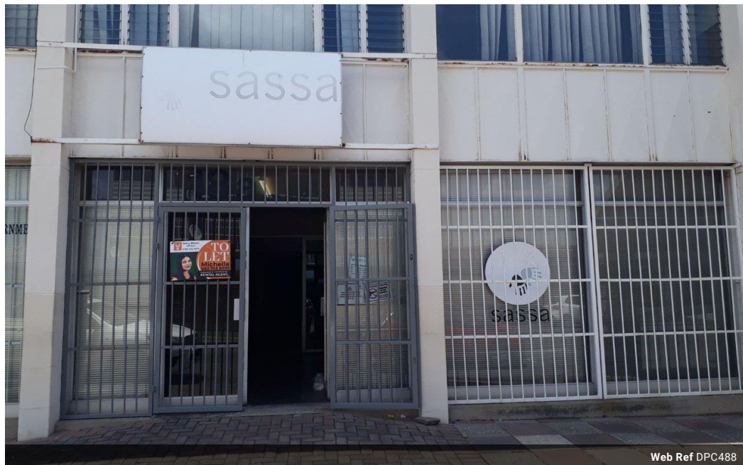
Web Ref DPC488

18 Klipriver Drive Three Rivers Vereeniging