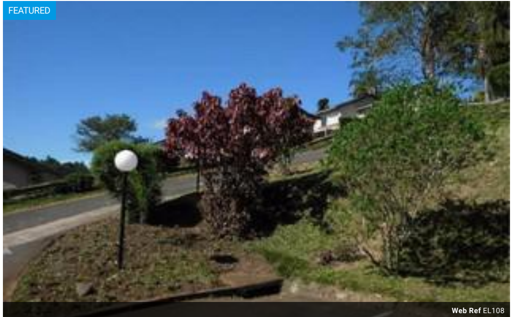
Web Ref EL108