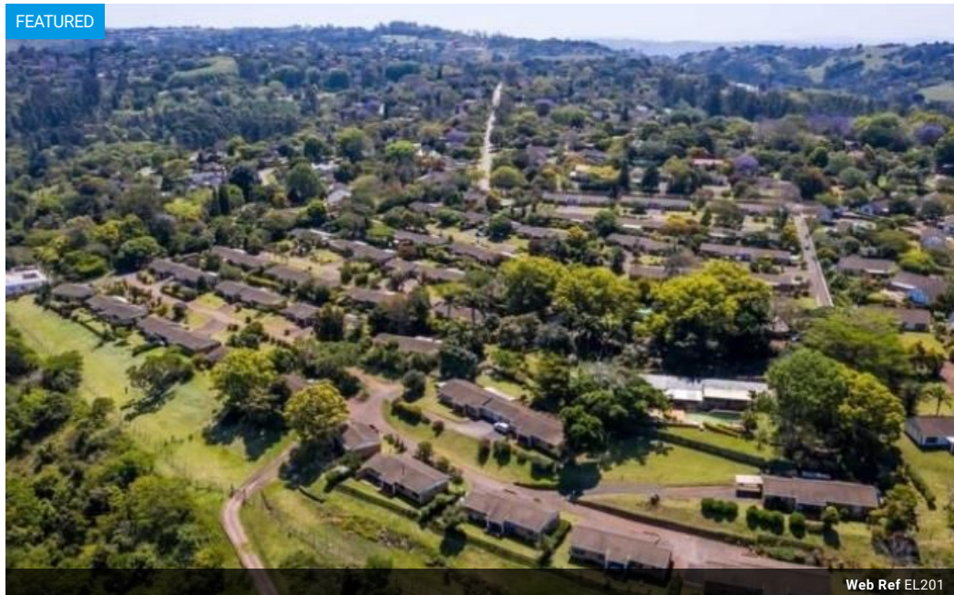
Web Ref EL201