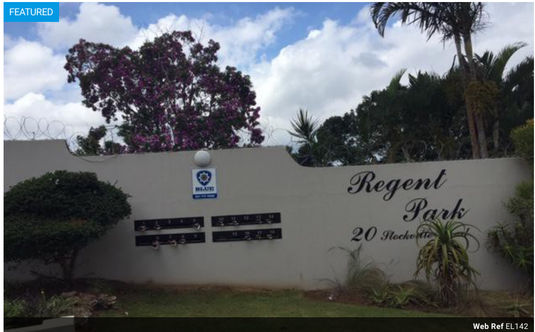
Web Ref EL142