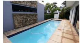
Web Ref EL187