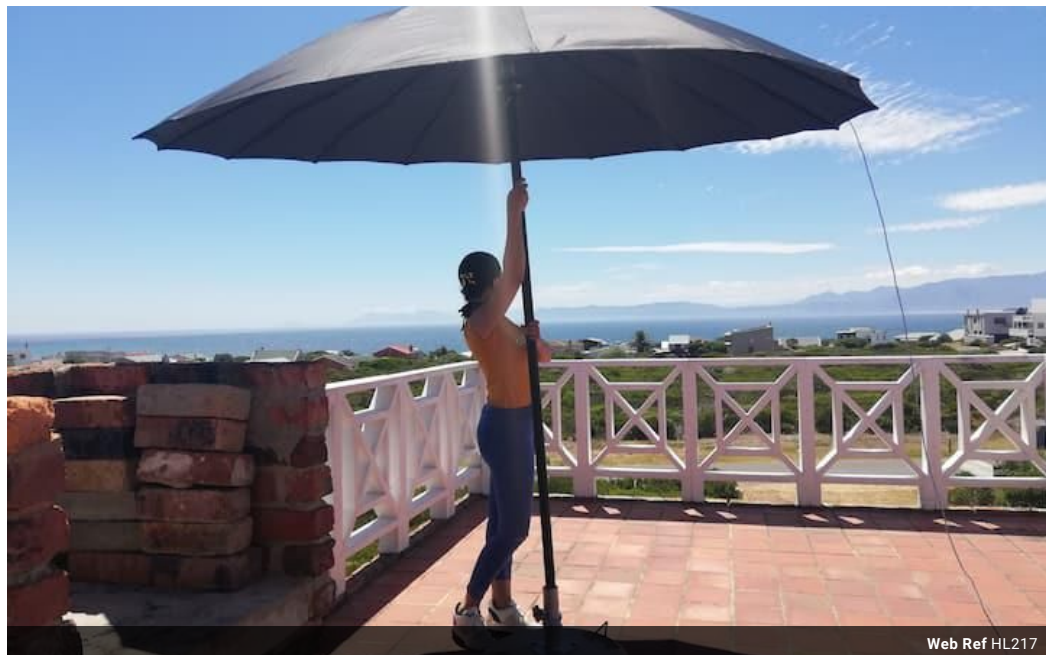
Web Ref HL217