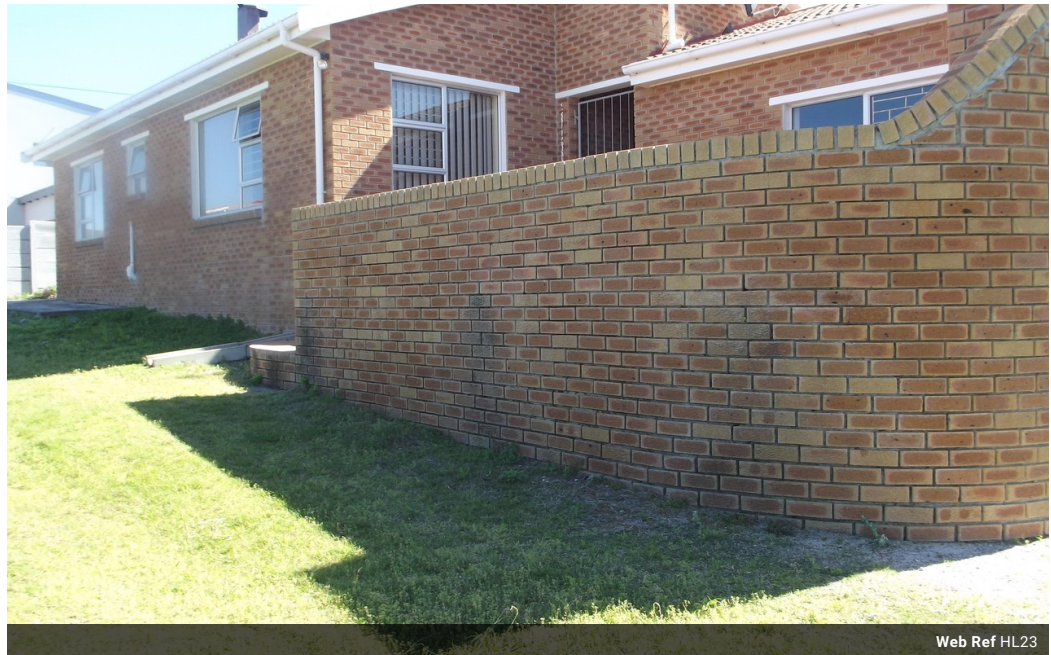
Web Ref HL23