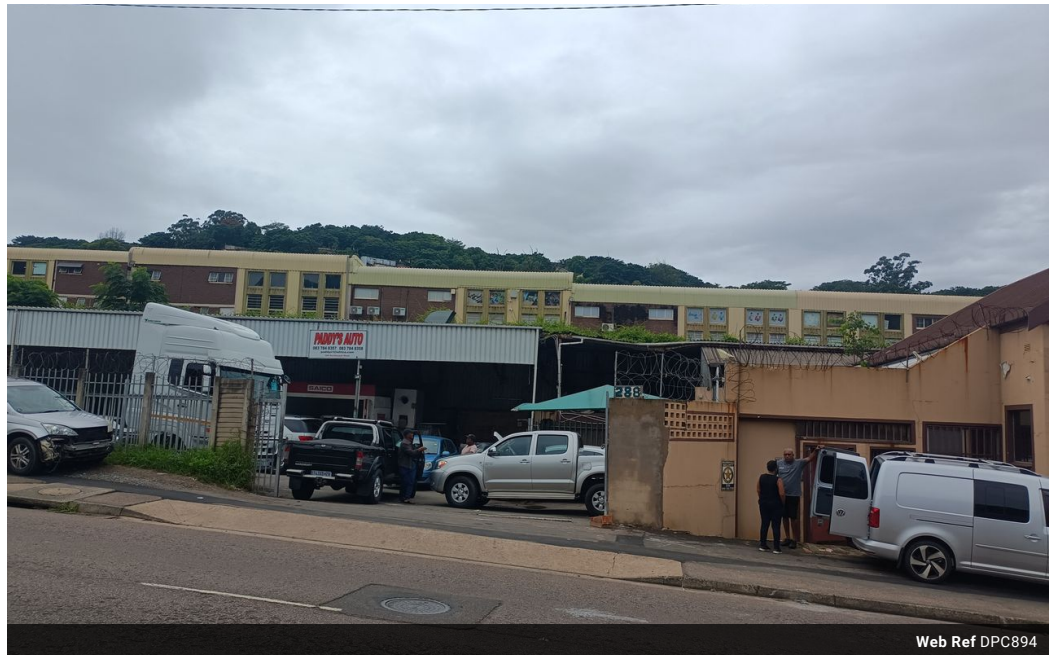
Web Ref DPC894