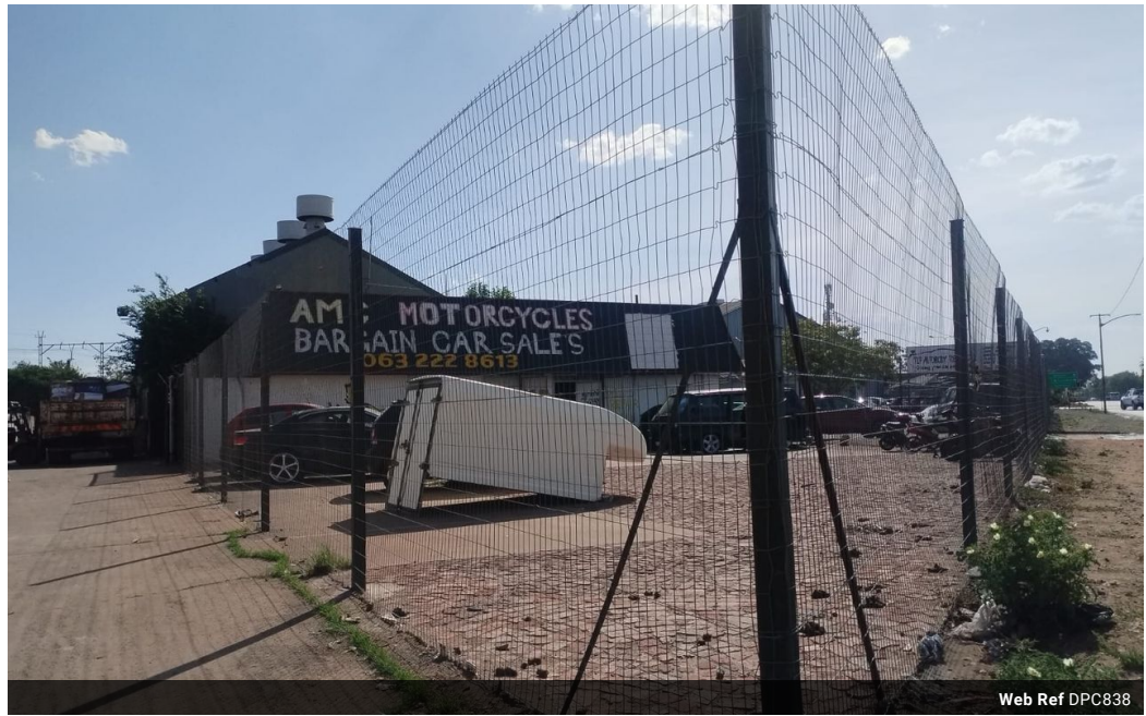
Web Ref DPC838

18 Klipriver Drive Three Rivers Vereeniging