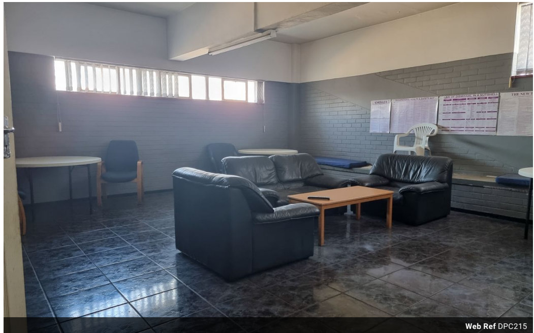
Web Ref DPC215

95 Victoria Street Oakdene Johannesburg South 2190