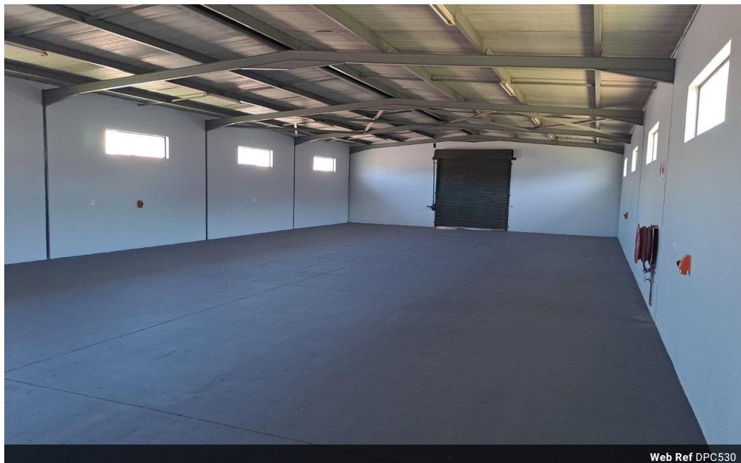
Web Ref DPC530

Shop 2, The Palms Shopping Center, Louis Trichardt Blvd, Vanderbijlpark, 1911