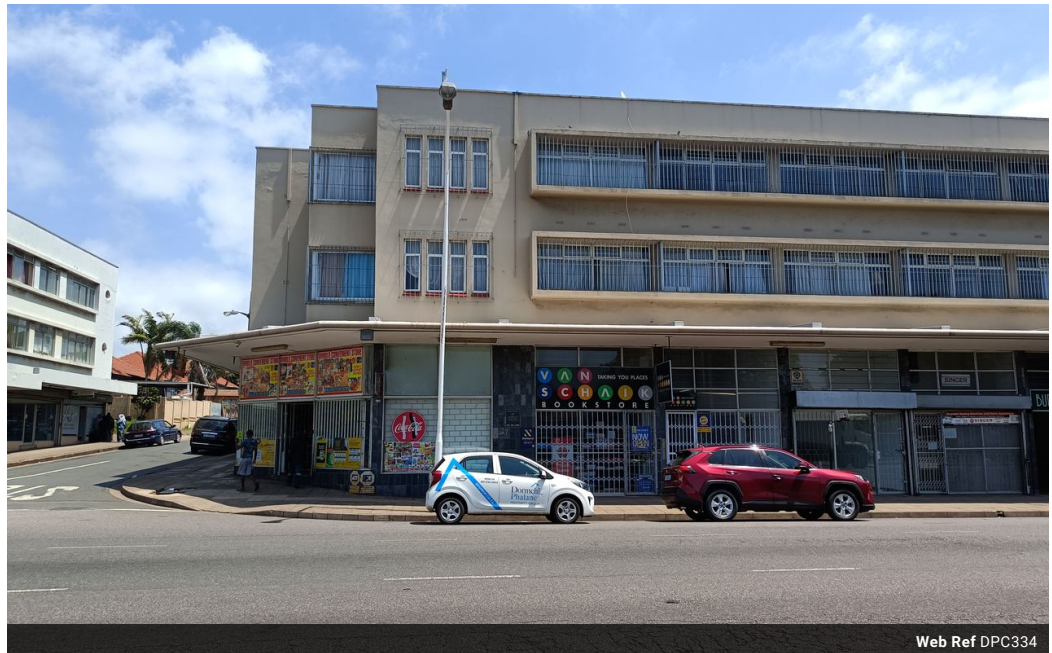
Web Ref DPC334