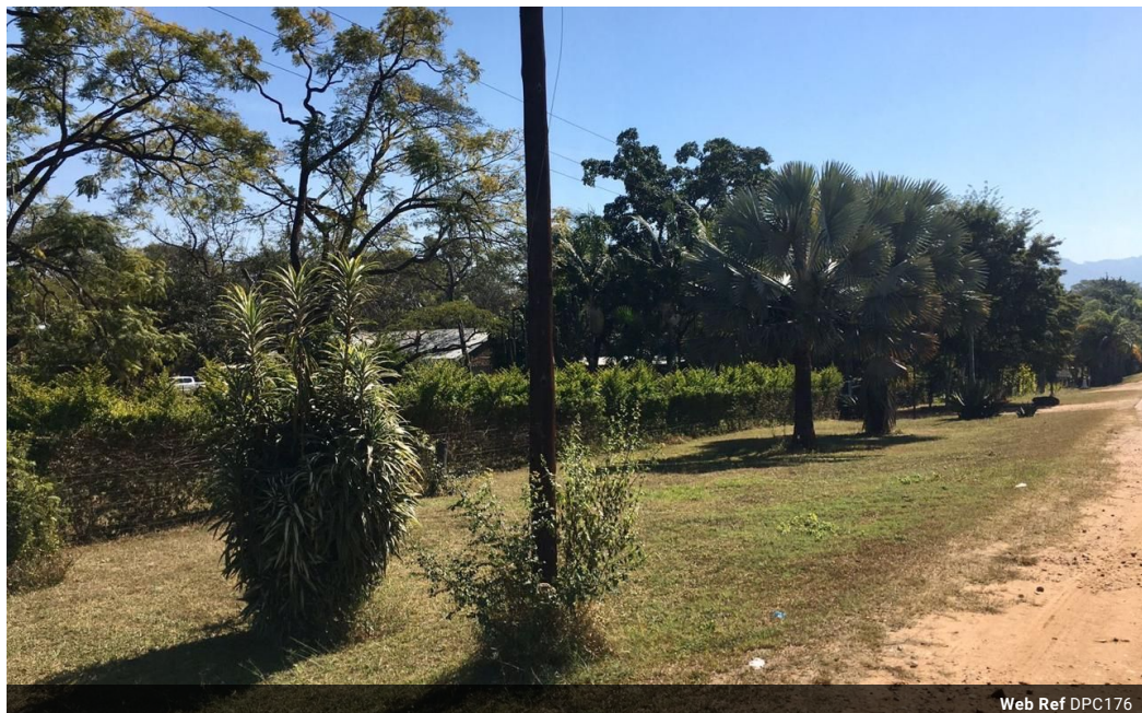
Web Ref DPC176

office no 4B Ndou Mall (behind Thulamela) Thohoyandou 0950