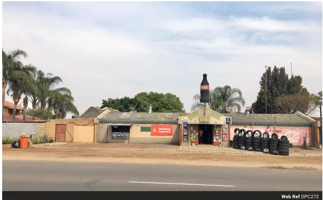
Web Ref DPC272