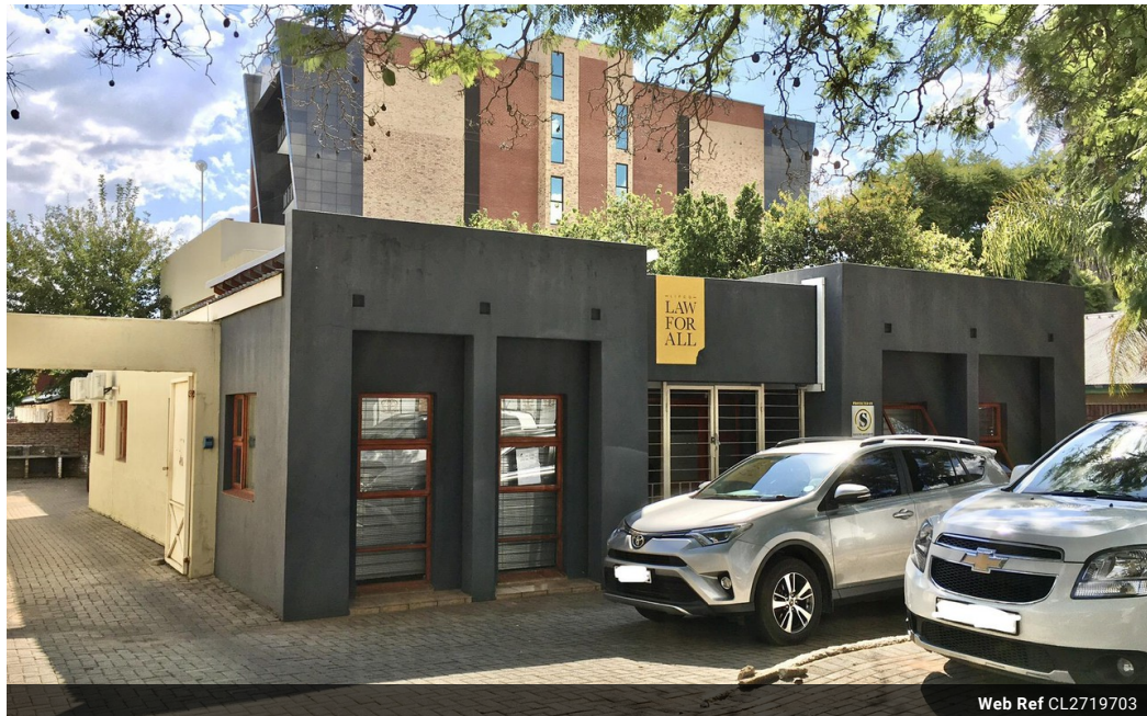
Web Ref CL2719703

office no 4B Ndou Mall (behind Thulamela) Thohoyandou 0950