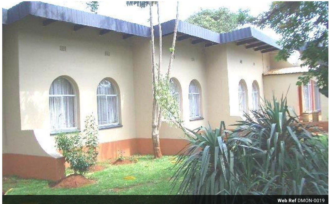
Web Ref DMON-0019