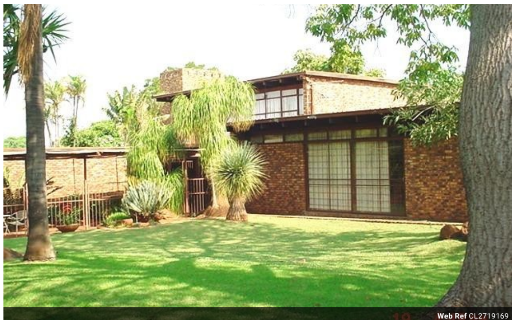
Web Ref CL2719169