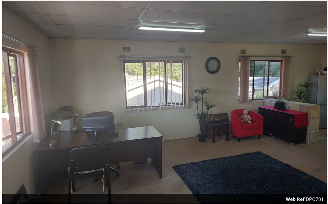
Web Ref DPC701

1 Knightbridge, 16 Westville Road, Westville