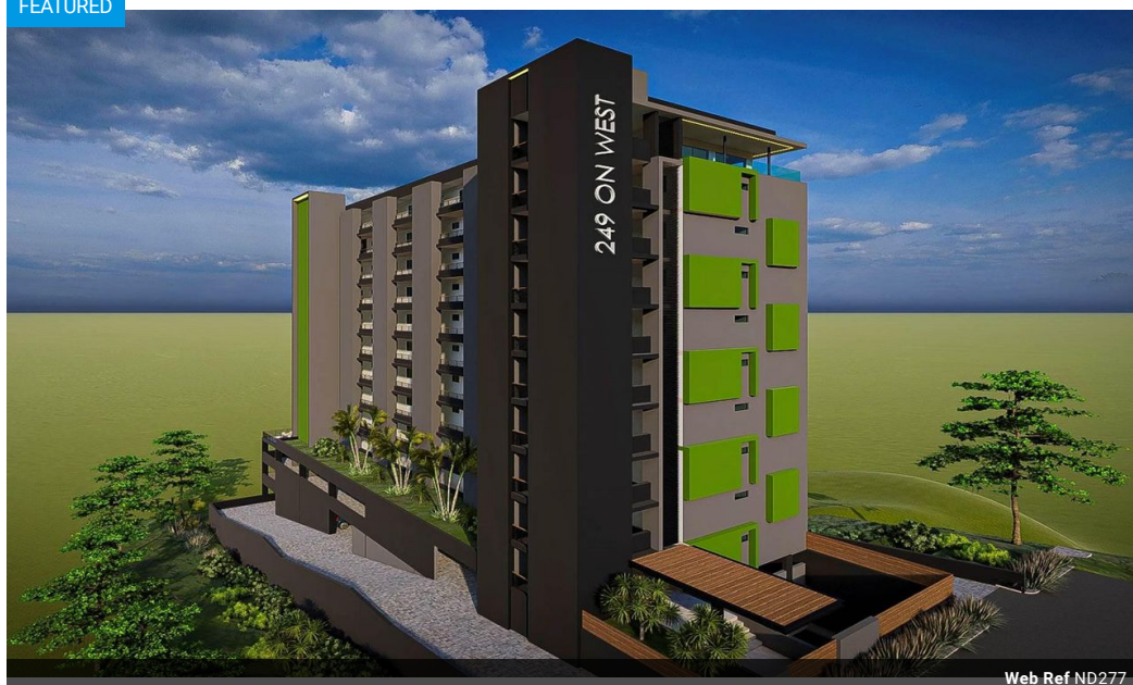
Web Ref ND277