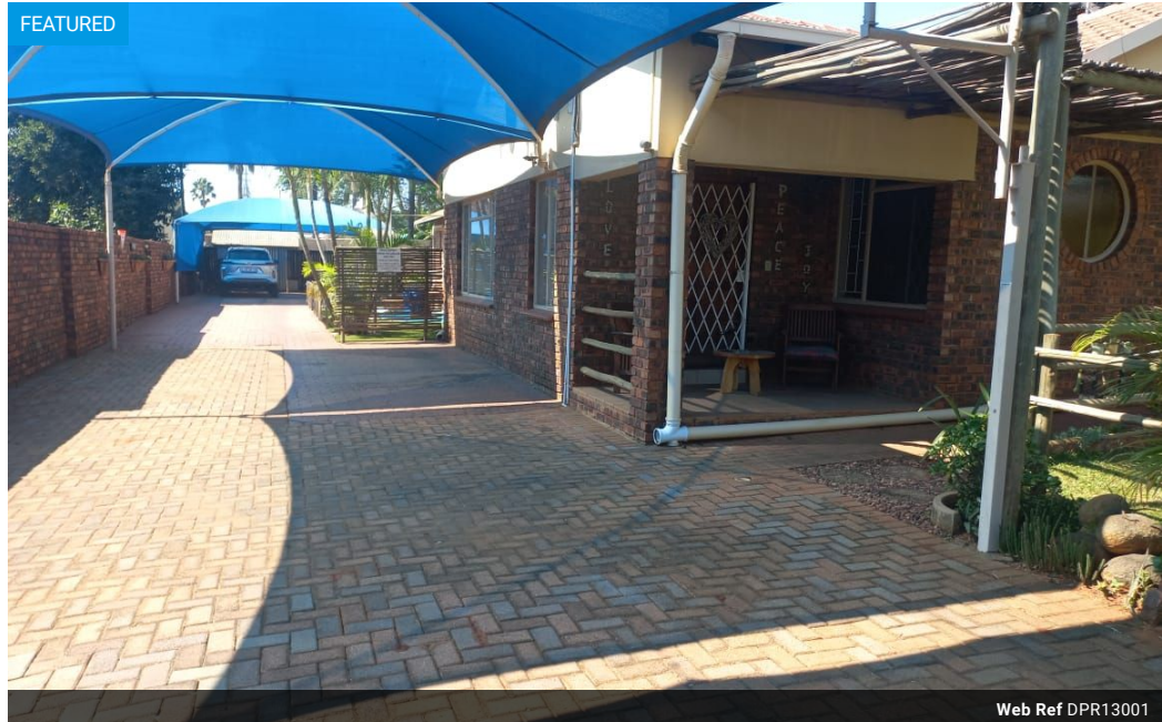
Web Ref DPR13001