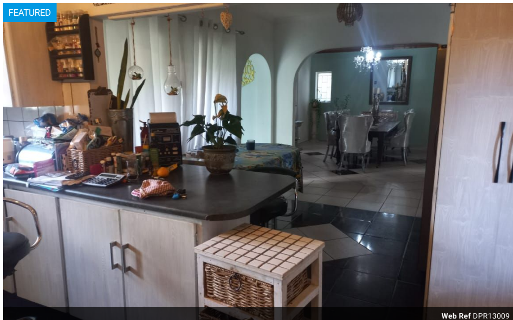
Web Ref DPR13009