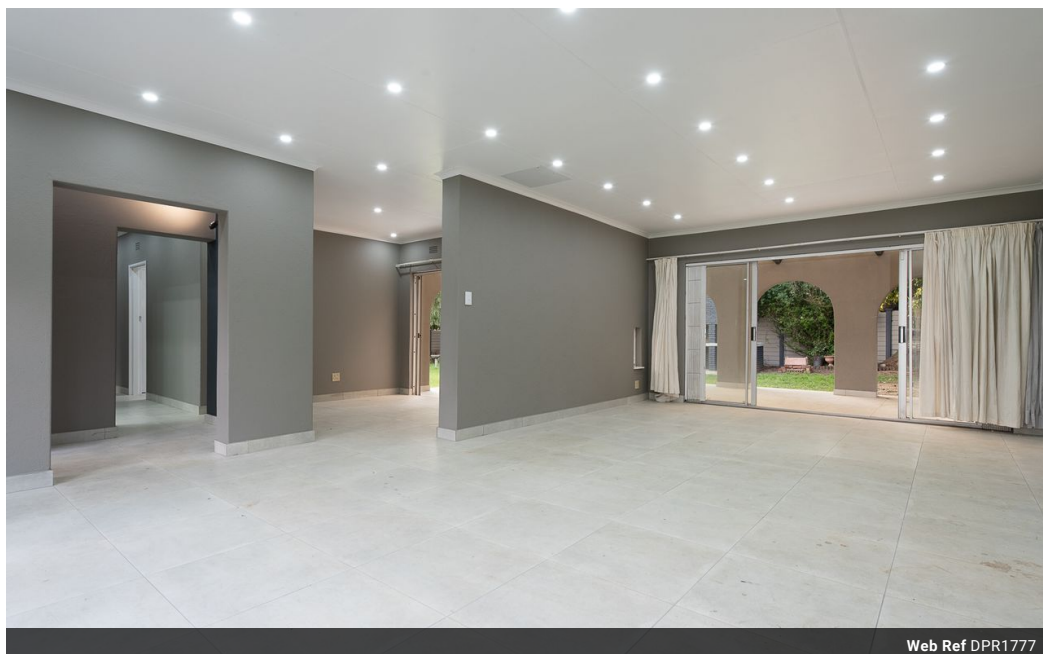
Web Ref DPR1777

95 Victoria Street, Oakdene, Johannesburg, Gauteng, 2190