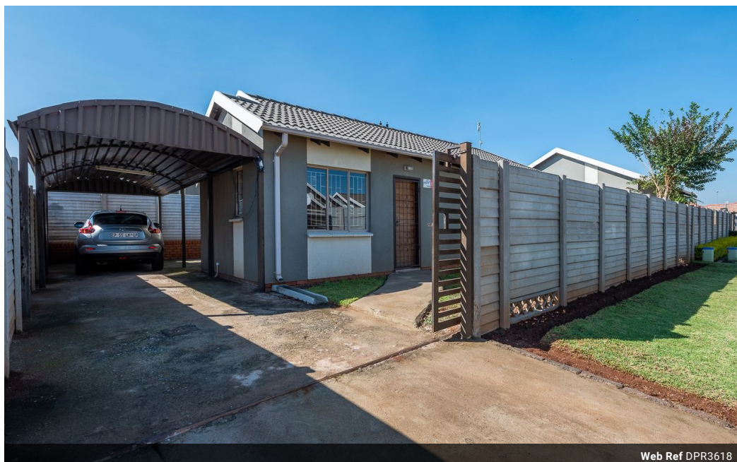
Web Ref DPR3618

95 Victoria Street, Oakdene, Johannesburg, Gauteng, 2190