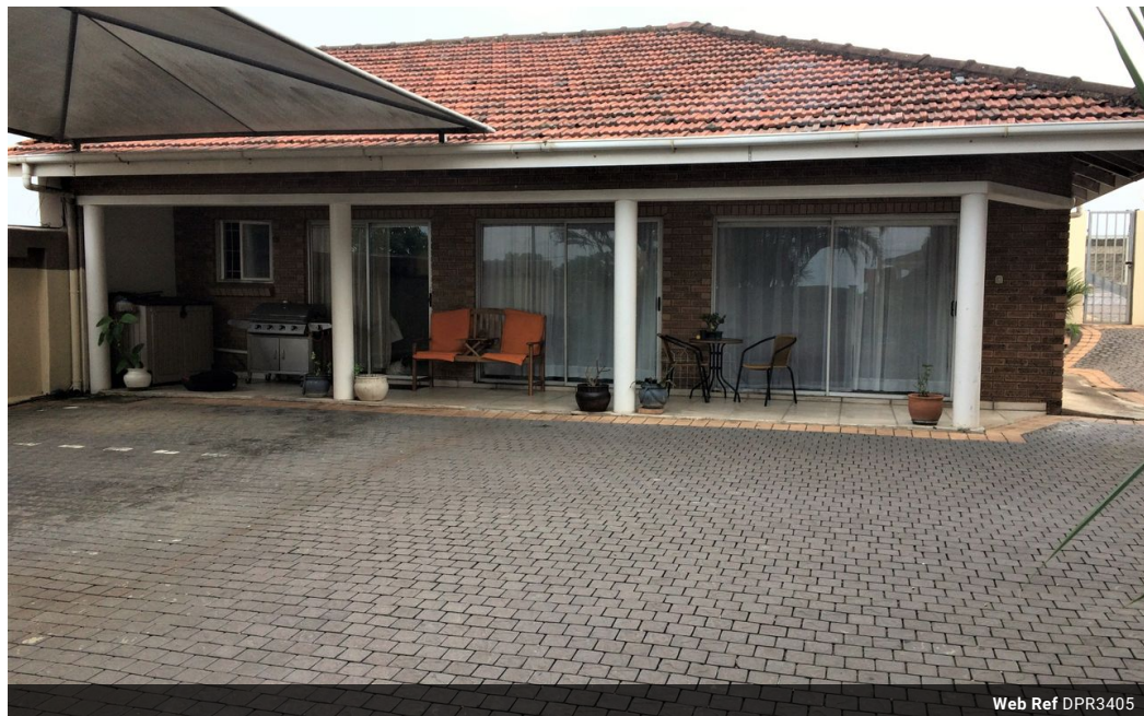
Web Ref DPR3405