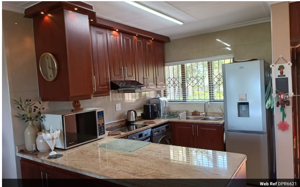
Web Ref DPR6621