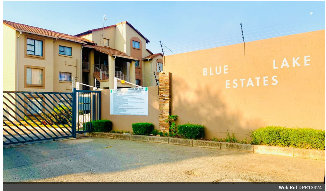
Web Ref DPR13324

18 Klip River Drive Three Rivers Vereeniging