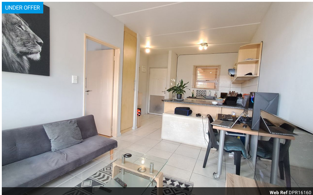
Web Ref DPR16160