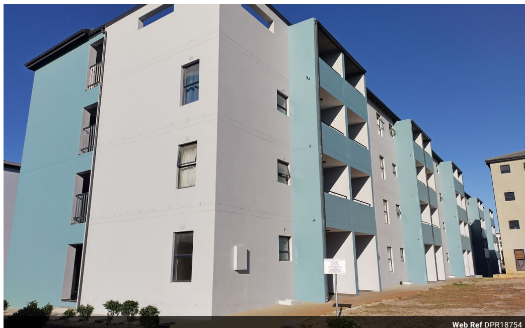
Web Ref DPR18754