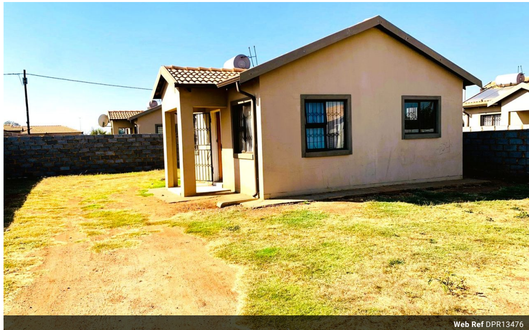
Web Ref DPR13476

18 Klip River Drive Three Rivers Vereeniging