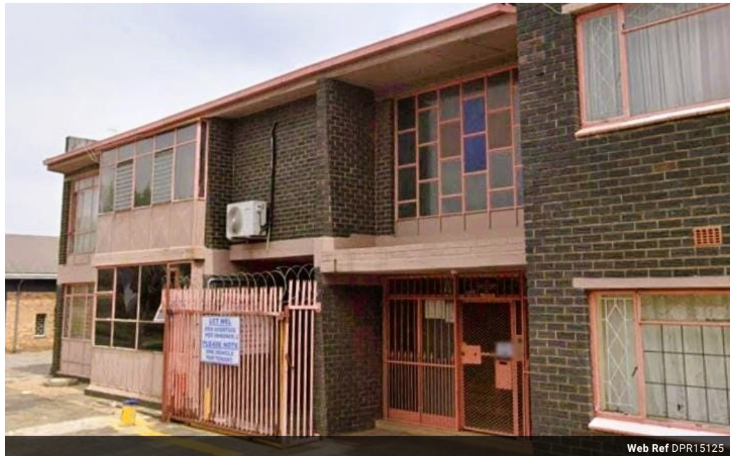
Web Ref DPR15125

18 Klip River Drive Three Rivers Vereeniging